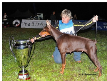
Paradise King of Darkness