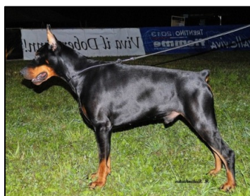
Quickstep King of Darkness