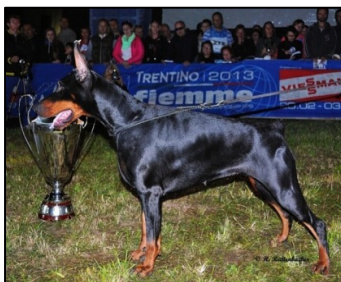
Eureka del Nasi