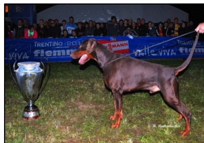
Pride of Russia Kaspj