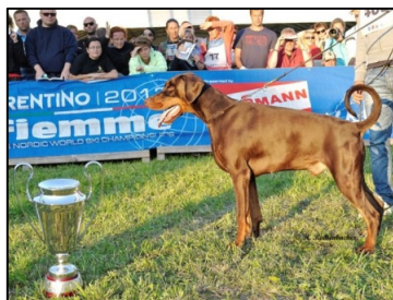
Oz di Casa Giardino